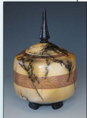
Lidded Jar with ferric chloride over horse-hair and terra-sig